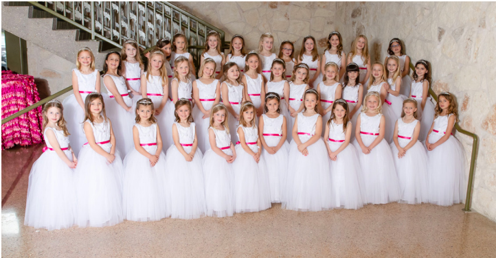
First Grade Princesses