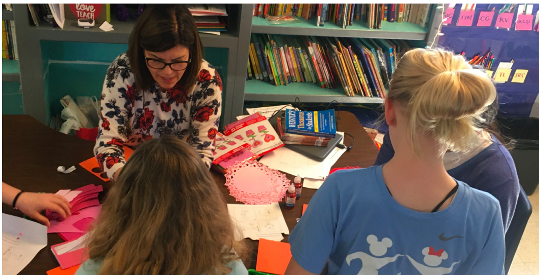
During 2021, Helping Hand Home’s UT Charter School offered 21,450 education hours to our children all of whom are healing from the trauma of childhood abuse and neglect.

Through a partnership with The University of Texas at Austin, Helping Hand Home operates an on-site charter school which caters to the unique educational and behavioral needs of its children in K-6th grade.