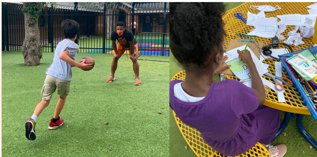
During 2021, children at Helping Hand Home participated in more than 2,863 various enrichment activities and field trips.

HHH provides 24-hour care for children ages 4-13 experiencing emotional and behavioral problems due to the traumatic stress of severe abuse or neglect.