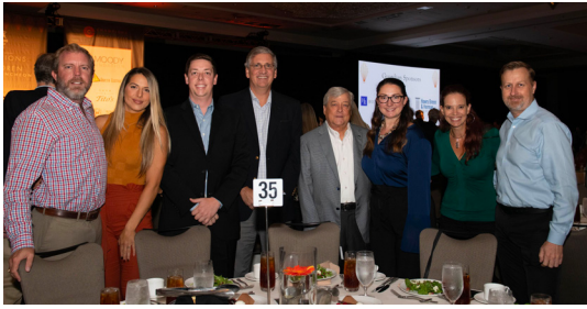
White Construction team