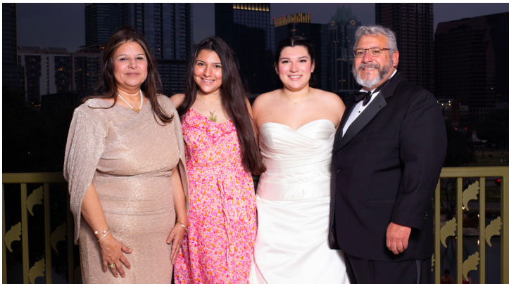
The Arriaga Family