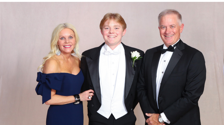
The Dollar Family