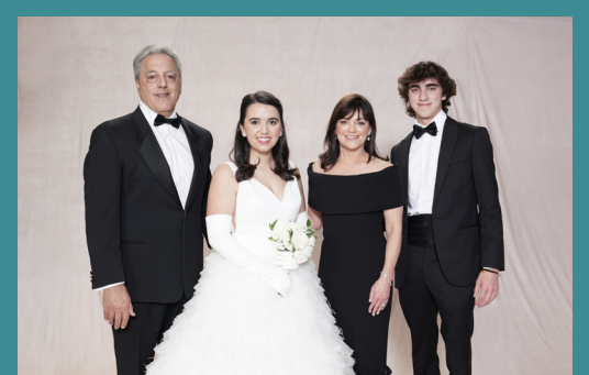
Crystal Ball Gala