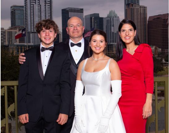
The Szygenda Family