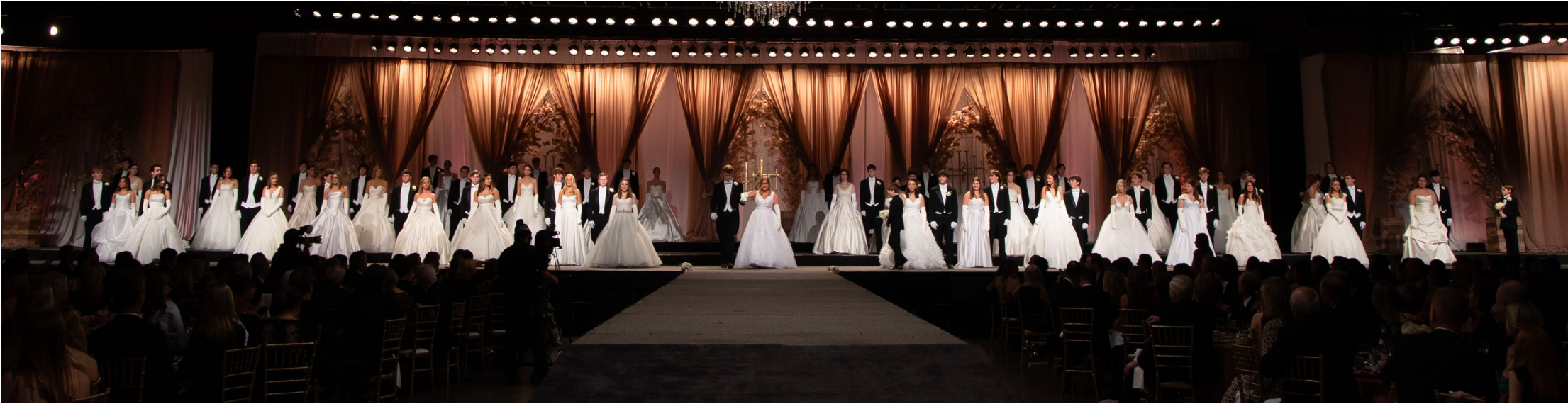
2022 Debutantes and Escorts