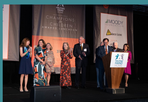
Champions for Children Awards Luncheon