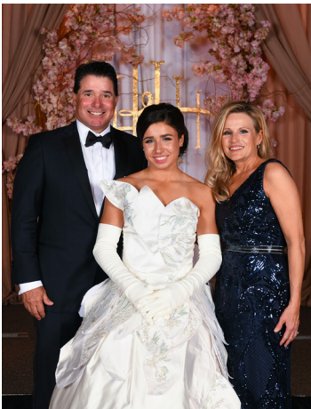
The Meserole Family