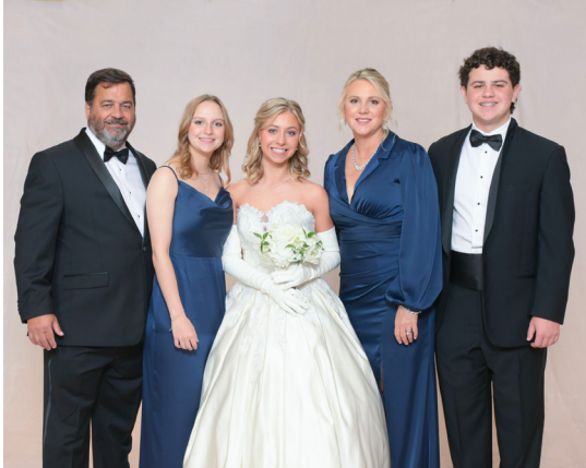
The Yonge Family