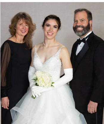
The Kizer Family