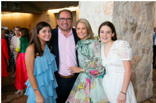
The Shifflet Family