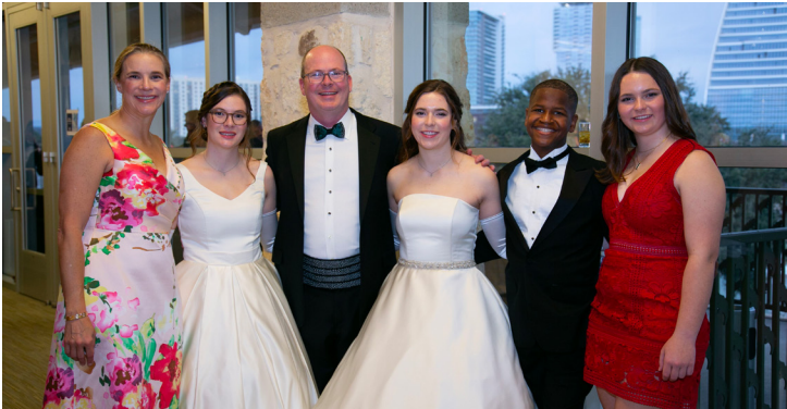
The Liverman Family