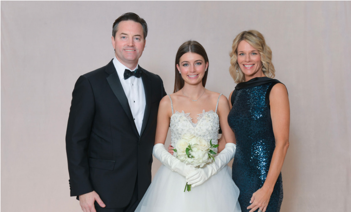
The Hicks Family