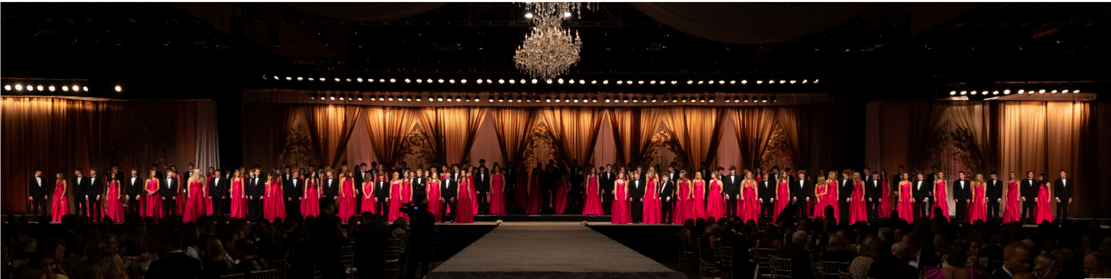
2022 Helping Hands